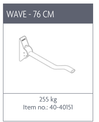
Can also be used for Ropox Toilet Lifter