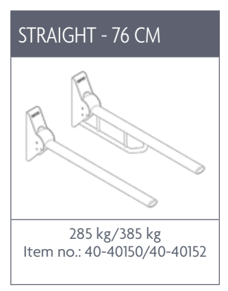
Can also be used for Ropox Toilet Lifter